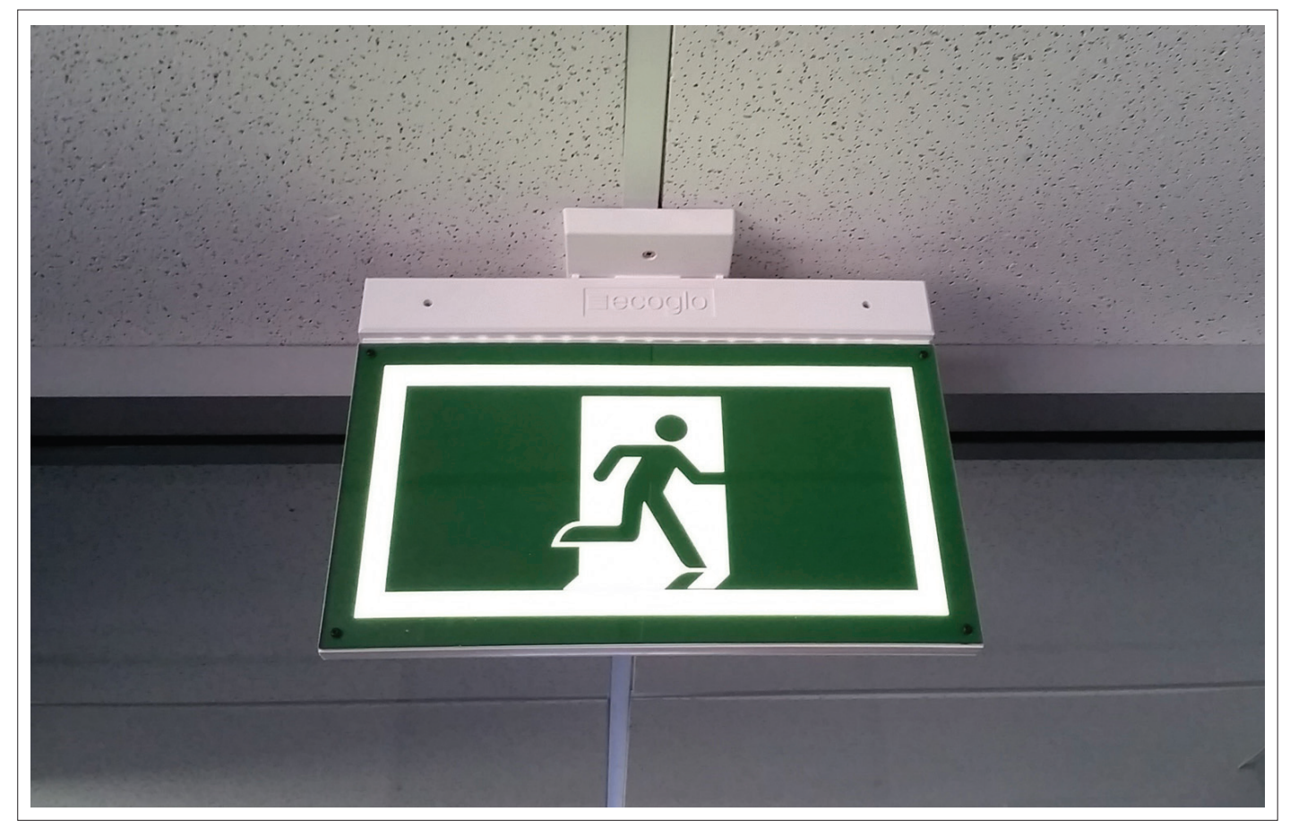
Ecoglo Hybrid PL Exit Sign

The lower performance threshold for standard LED lighting is generally accepted as 70% of the luminance level that existed when the product was new. However, the relevant standard for exit signs (AS/NZS 2293.3) does not mandate this benchmark. Indeed, some manufacturers base their products' life expectancies on the time taken to reach just 30% of initial brightness, resulting in unrealistic life expectancy claims.