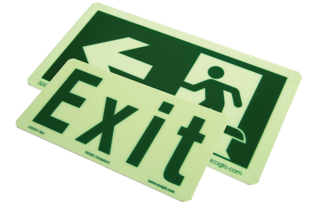
Ecoglo passive PL signs using energy harnessed from surrounding light

PL sign provides the ongoing energy required to charge the PL panel. This sort of PL sign is known as a 'hybrid' because it can derive energy from both ambient light and its own LEDs... and it is this class of exit sign that Ecoglo has revolutionised through its latest research and development program.